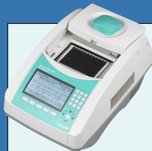
Sliding, adjustable heated lid