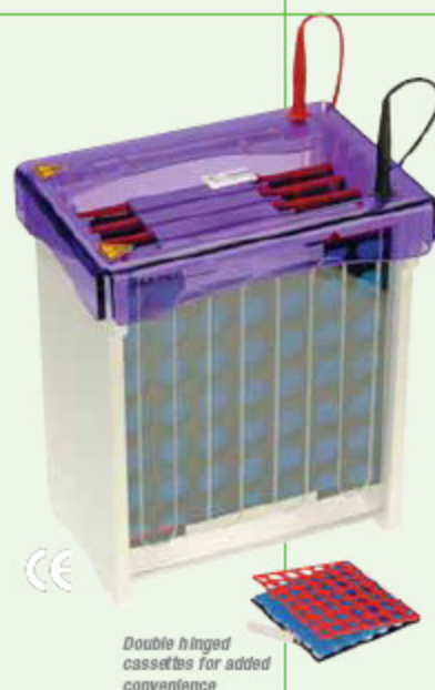
Double hinged cassettes for added convenience

A uniform electric field is provided by a high intensity coiled electrode and ensures uniform transfer across the blot surface. The cassette's open architecture ensures the maximum blot area allows direct transfer of current. Its rigid construction ensures contact between the gel and membrane is retained throughout the blot and an even pressure is maintained. These units are compatible with magnetic stirrers to aid heat dispersal and prevent pH drifts in the buffer due to incomplete buffer mixing. Each system includes a cooling pack to further enhance transfer efficiency by removing excess heat. This also saves on buffer for added economy.