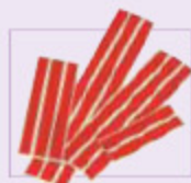
Loading guides allow easy well identification and sample loading