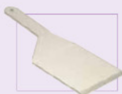
Scoops for safe transfer of gels