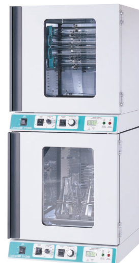
Incubators can be stacked using the stacking adapter

A full range of accessories is available to complement the 211 Series. All three models include three shelves (one is a half-size shelf, allowing tall vessels to be accommodated). Two shaking platforms (sold separately) are available for the 211DS and 211DHS; The flask platform is predrilled to accept a variety of different sized clamps while the flat platform has a non-slip rubber mat for holding dishes and plates. The rotisserie supplied with the 211DHS accepts Labnet's large and small hybridization bottles. These high quality, leakproof bottles are available with or without a plastic safety coating. Two sizes of hybridization mesh facilitate the handling of membranes and aid in the flow of solutions when multiple membranes are hybridized in the same bottle.